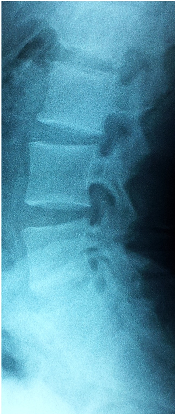
Figure 1 Plain X-ray of lumbar spine showing squaring of the lumbar vertebrae.

SwS remains a rare condition that can be drug induced (lithium, furosemide, oral contraceptives, trimethoprim-sulfamethoxazole, and so on) or associated with other pathologies, including infections in 20 to 30% of cases (bacterial, viral infections), malignancies in 10 to 20% of cases (hematological disorders in 75% of cases especially acute myelogenous leukemia, solid tumors in 35%, such as carcinomas of the genitourinary organs, breast, thyroid, and gastrointestinal tract), and chronic inflammatory disorders in 10 to 20% of cases (rheumatoid arthritis,