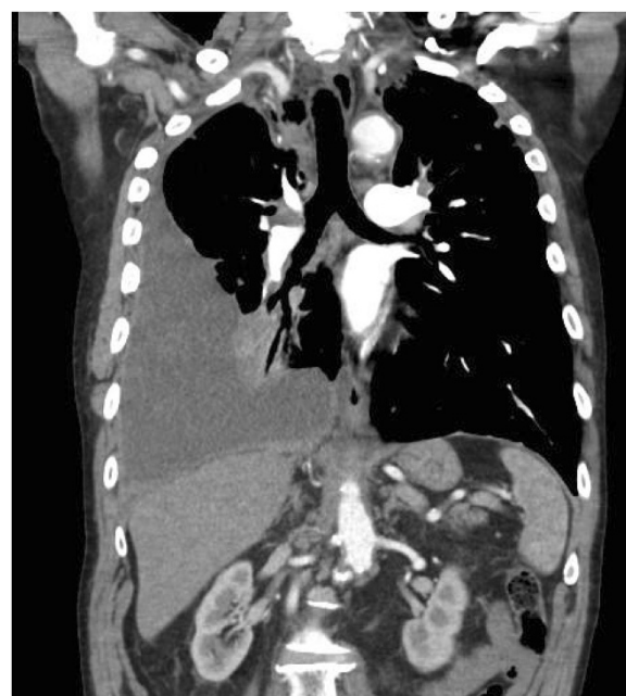
Figure 1 Chest computed tomography scan confirming a large, right-sided pleural effusion in the setting of metastatic papillary thyroid carcinoma, prior to drainage and pleuroscopy.

Medical thoracoscopy revealed multiple areas of tumour deposits on the parietal and visceral pleura, clearly shown in the additional movie file (see Additional file 1). Many of the tumour nodules had the same