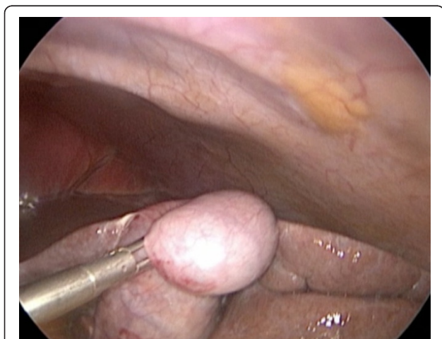
Figure 2 Gallbladder retraction.

Situs inversus totalis may affect the intra-abdominal viscera as well as the intrathoracic organs [2]. It can be associated with many other anatomical variations, including heart malformations and Kartagener's syndrome (bronchiectasis and sinusitis coexistence) [2,3]. There is no evidence to suggest that gallstones are more common in people with this condition. However, left upper quadrant pain may delay the diagnosis. An ultrasound scan can confirm the presence of gallstones and the left-sided gallbladder. Some authors suggest that it would be very useful to perform a magnetic resonance cholangio-pancreatography (MRCP) procedure in order to reveal the exact anatomy of the biliary tract [3], thus decreasing intra-operative complications and enabling better planning of the surgical procedure. Pre-operative knowledge of the presence of malrotation and its details is of prime importance, even more so when performing laparoscopic or minimally invasive surgery.