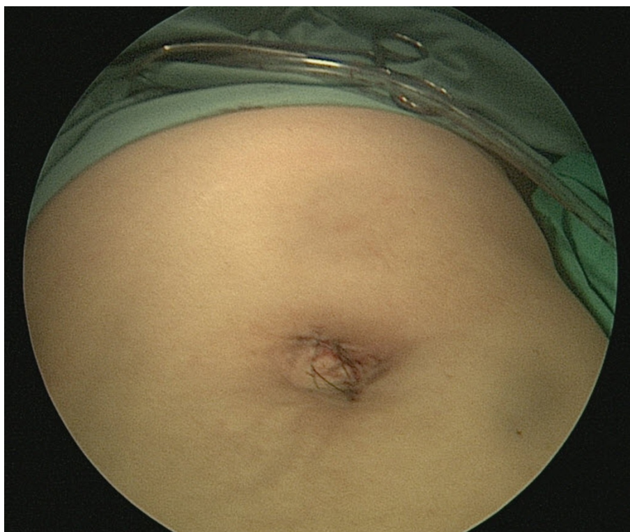
Figure 3 Single-port incision closed.

images. A copy of the written consent is available for review by the Editor-in-Chief of this journal.