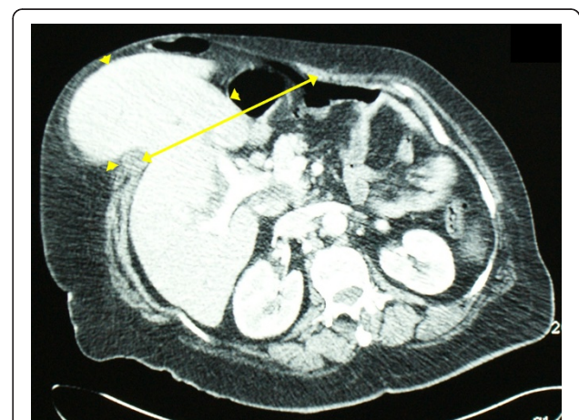
Figure 2 Protrusion of the left hepatic lobe (arrow heads) through the abdominal wall defect (arrow) on axial view of computed tomography.