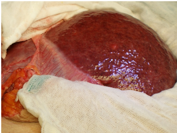
Figure 3 Surgical aspect once the left hepatic lobe was dissected and the hernia content was reduced.