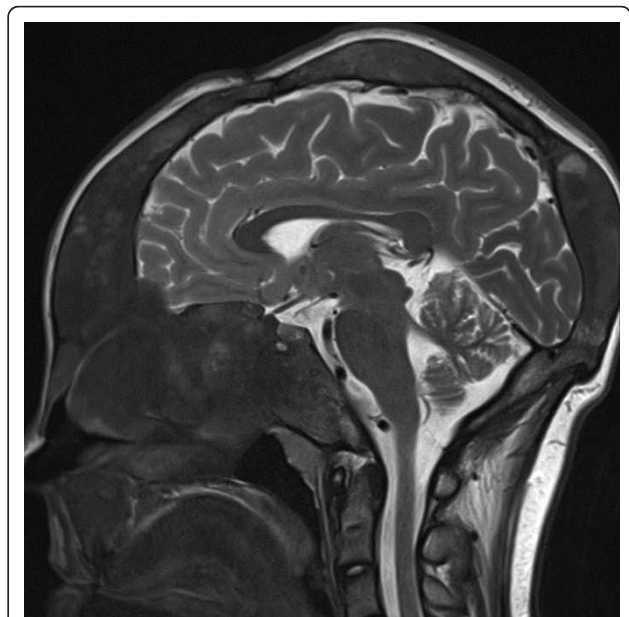
Figure 2 T2-weighted sagittal magnetic resonance image. Shows massive thickening of her skull base due to fibrous dysplasia and a pituitary adenoma.