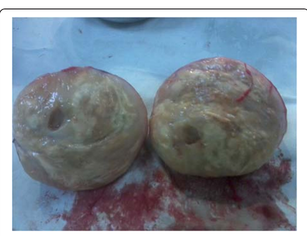
Figure 4 Cut section of the resected specimen.

Schwannomas occur predominantly in men aged 20 to 50 years. Sites may vary, but they most commonly occur in the head and neck region [1-3] as well as flexor tendon sheaths of extremities [4]. Unusual locations such as the bladder [5], scrotum [6] and fallopian tubes have been reported [9]. Schwannomas occurring in the pelvis are rare and account for only 1% of cases [6]. Such