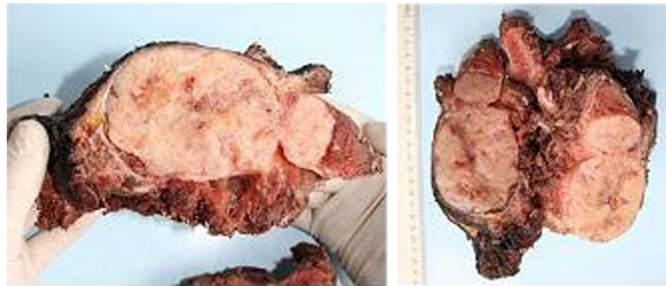
Figure 2 Material resected from the scapula and peripheral tissue mass. An elastic nodular mass is observed on the anterior (outer, ventral) surface of the scapula, 13 cm × 10 cm × 5 cm in size, with a 0.2 cm-thick pseudocapsule with a grayish yellow cut surface. The mass destructed the medullary bone medially 6 cm in length and shows soft tissue invasion. Soft tissue distance to surgical border is 2 cm.

massive gastrointestinal bleeding, perforation or obstruction, may occur.