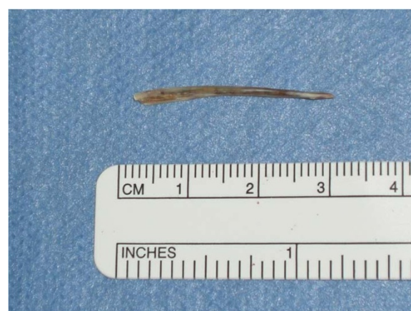
Figure 2 Removed fish bone. The removed fish bone is 28mm in length.

Our patient's postoperative course was uneventful. No esophageal leakage was observed during an esophagography, and she was allowed oral food intake seven days after the surgery. She was discharged nine days after surgery, and no evidence of recurrence was seen over the postoperative follow-up period of 42 weeks.