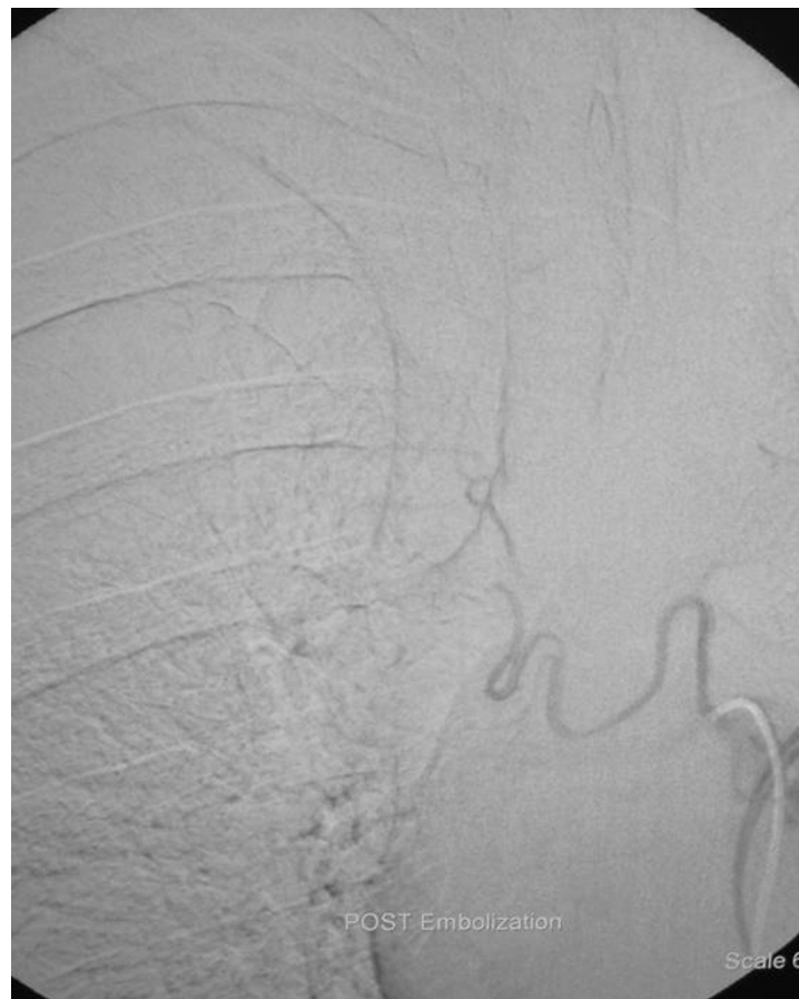
Figure 2 Elimination of pathologic hypervascularity after embolization with tris-acryl gelatin microspheres (500-700 µm) injected through the cobra catheter.

Life-threatening hemoptysis is one of the most serious emergencies in pulmonary medicine. The initial approach is no different than for any other bleeding or hemodynamically unstable patient. According to standard management protocols, the physician's primary goals include stabilizing the patient and securing the airway, identifying the bleeding site and efficiently containing the hemorrhage [2]. Localization of the bleeding site is usually accomplished with imaging studies (chest x-ray, CT) and bronchoscopy. In some cases, however, no underlying pulmonary pathology can be identified. When no associated comorbidity can be confidently identified, a common risk factor is cigarette smoking [10].