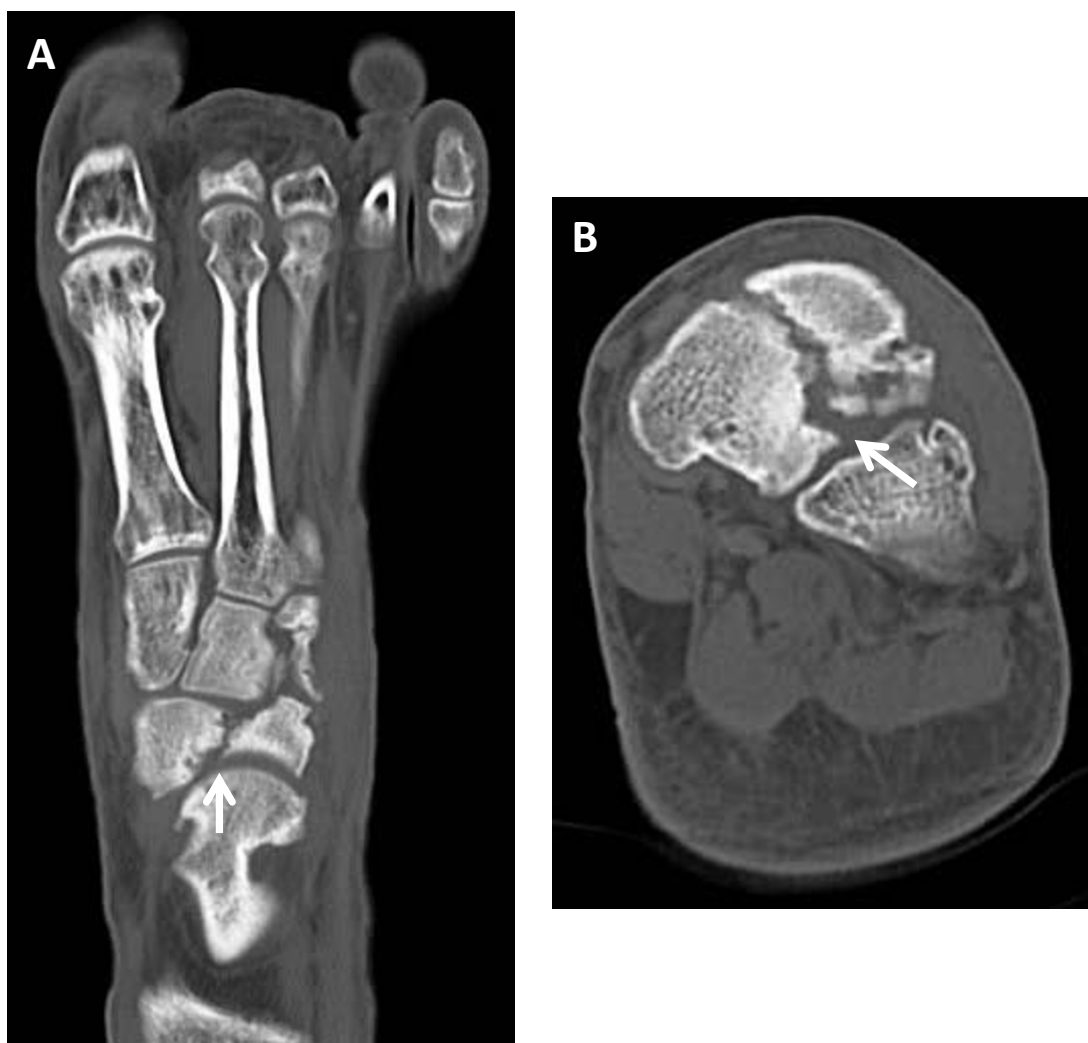
Figure 2 Computed tomography scans at the time of presentation. (A) Axial image. (B) Coronal image.

with traumatic arthritis [3,6]. Most of the literature addresses patients with either inflammatory arthritis or adult acquired flat foot [4,5,7-11]. Main reported that the fracture of navicular was caused by shearing forces between the cuneiforms and the talar head, and triple arthrodesis was effective for persistent symptoms [12] while Chen maintained that isolated talonavicular arthrodesis provided both pain relief and functional improvement in traumatic arthritis [3].