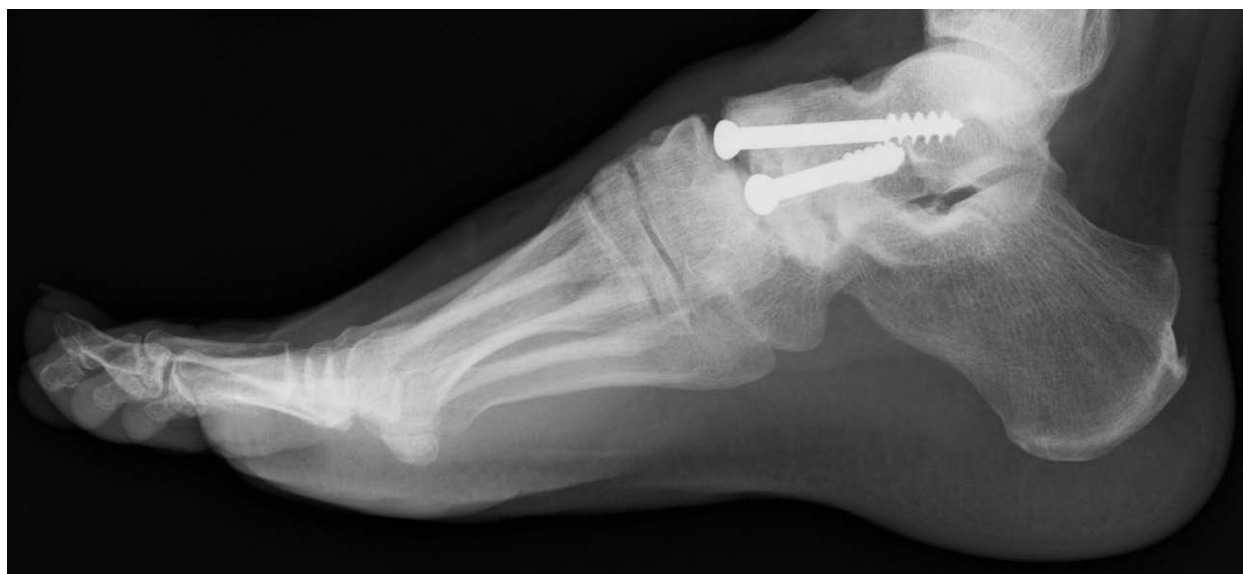
Figure 5 Lateral radiograph at one year after the operation showed completely united talonavicular joint.