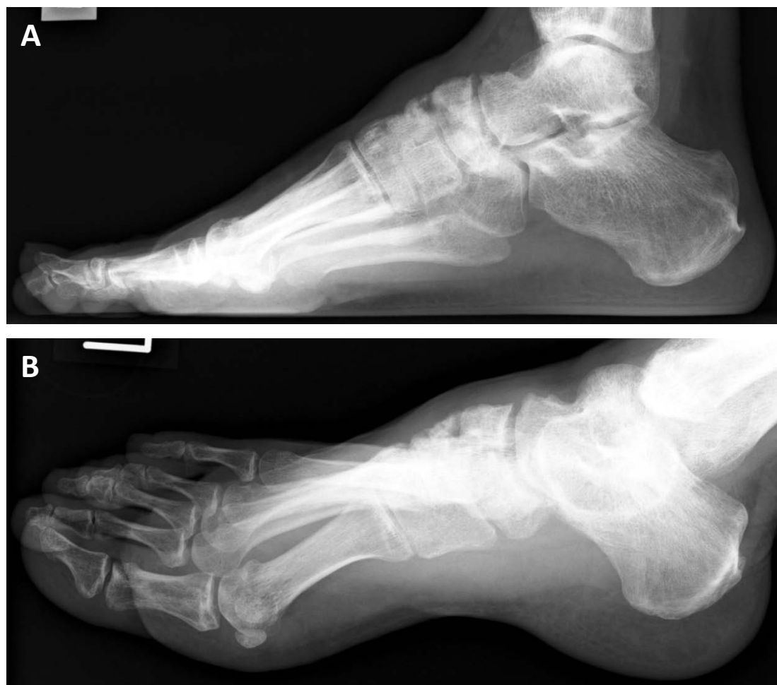
Figure 1 Radiographs at the time of presentation showed atrophic bones and non-union of navicular fragments. (A) Lateral radiograph. (B) Oblique radiograph.

temporary resolution of pain. Radiographs and CT scans revealed that navicular bone union had not been obtained and the fragments were atrophic. There was also associated incongruity of the cuneonavicular joint (Figure 1 and 2). T1-weighted MRI showed low-signal intensity on the lateral fragment, and T2-weighted MRI revealed high-signal intensity on the talonavicular joint and a slightly ragged joint cartilage, and a homogenous high-signal intense cystic lesion in the talus (Figure 3). We suspected there was avascular necrosis of the navicular bone fragment, and primitive osteoarthritis of the talonavicular joint because of the preserved joint space.