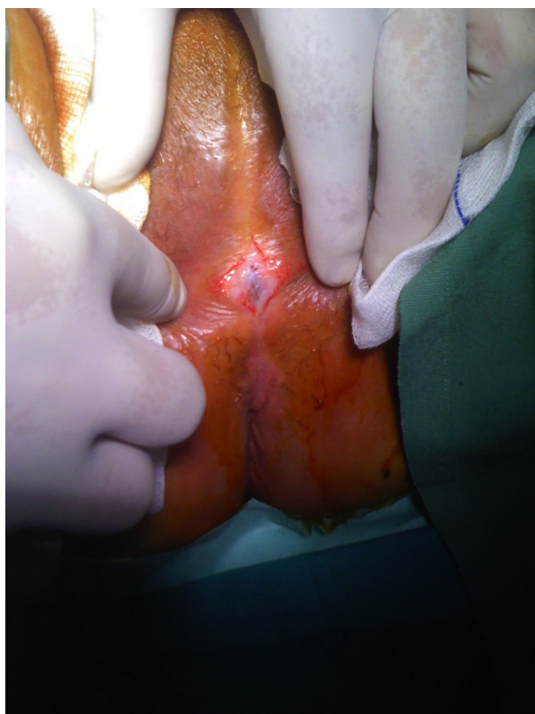
Figure 1 Labial fusion: pre-operational image of labial fusion. The labia majora are completely fused, leaving a very small opening to allow urination.

followed by a drop on day two (142 mg/L) and then the level remained within normal limits throughout the rest of her hospital stay and finally an elevated lactate dehydrogenase level (286 U/L). Carcinoembryonic antigen (CEA), \alpha -fetoprotein (AFP), \beta -human chorionic gonadotropin ( \beta -HCG), cancer antigen 125 (CA 125), cancer antigen 19.9 (CA 19.9) and cancer antigen 15.3 (CA 15.3) levels were all normal. Serum urea, creatinine, sodium and potassium levels were within normal limits. A computed tomography (CT) scan of her abdomen on admission showed a cystic (7 × 4.5 cm) formation within the pelvis minor in the anatomical position of the right adnexa; the formation appeared to be tubular in shape most likely suggesting a hydrosalpinx or pyosalpinx.