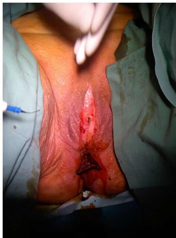
Figure 2 Dissected labia majora. Post-operative appearance of the labia after the blunt dissection and separation.

On day two of admission our patient underwent laparoscopic surgery during which the right pyosalpinx was identified and subsequently resected (Figure 2), and in the end the labia majora were reconstructed via blunt labial dissection and separation (Figure 3). During the operation, we also identified accumulation of a large amount of urine in the vagina, suggestive of urocolpos,