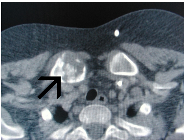
Figure 1 Computed tomography scan showing an osteolytic process with periosteal reaction of the right proximal clavicle.

fluorodeoxyglucose positron emission tomography (FDG-PET) was not available.