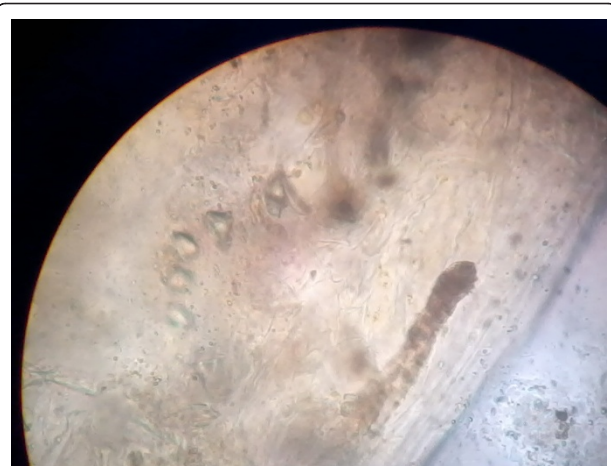
Figure 2 Adult tapeworm showing scolex and segments.

diarrhea, and abdominal discomfort. Diphyllobothriasis is associated with eating raw fish and is endemic to Serbia, Scandinavia, North America, Japan, and Chile, with more than 2% prevalence worldwide [2].