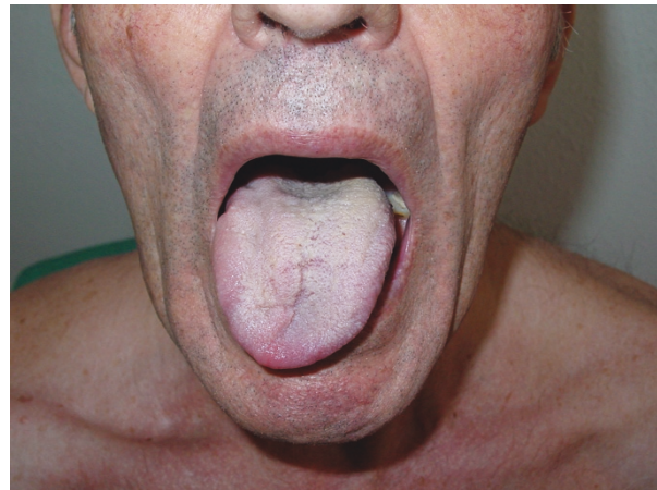
Figure 2 Paresis of cranial nerve XII.

neoplasm, a biopsy was performed. The anatomic pathology findings were bilateral common adenocarcinoma, with a Gleason grade of 8 (4+4), affecting 60% of the tissue. There was no presence in the periprostatic adipose tissue and no perineural infiltration.