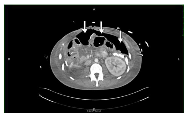
Figure 2 Post-operative computed tomography (CT) scan demonstrating a large volume pneumoperitoneum due to bronchoperitoneal fistula.