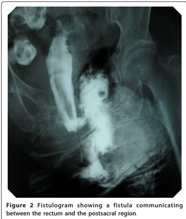
Figure 2 Fistulogram showing a fistula communicating between the rectum and the postsacral region.

Day 37, and she developed septic shock once again along with renal failure. Her general status temporarily improved with continuous hemodiafiltration (CHDF) and administration of catecholamines. Although colostomy was performed on Day 55, she died on Day 80 because of persistent shock and gastrointestinal hemorrhage (Figure 3).