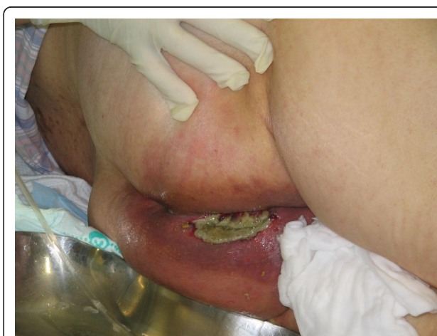
Figure 1 The appearance of fistula-in-ano at the early stage.