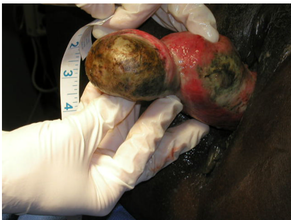
Figure 1 Prolapsed uterine fibroid attached at the uterine fundus. Notice the areas of necrosis on the fibroid as well as the endometrial lining, inverted in this case. The tubal ostia could not be visualized.

we unsuccessfully attempted to replace the uterus. Therefore we decided to open the abdomen. After packing the bowel away we inspected the pelvis (Figure 3). This is an abdominal view of an inverted uterus noting bilateral round ligaments and utero-ovarian ligaments drawn into an approximate 3 cm circle. We attempted to follow the round ligaments into the circle as classically described by Huntington with pressure exerted from the vagina but were not successful [7]. The constricting ring was too tight. After identifying both ureters, we performed Haultain's procedure followed by abdominal hysterectomy and bilateral salpingo-oophorectomy [8]. The patient was discharged on the third postoperative day and no problems were identified on two post-discharge clinic visits. The pathology report noted a 40 gram uterine leiomyoma with extensive necrosis and a 170 gram