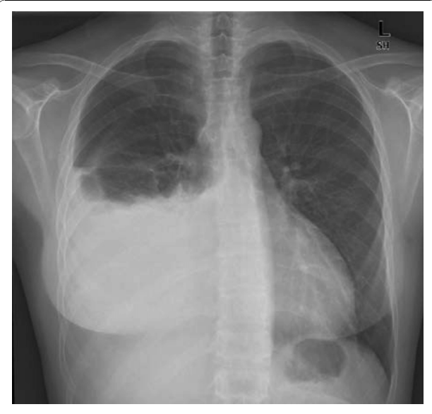
Figure 1 Chest X-ray showing right pleural effusion.

The patient was temporarily transferred to hemodialysis via a tunneled line and underwent right videoassisted thoracoscopic surgery and talc pleurodesis. An intraoperative methylene blue test failed to identify the