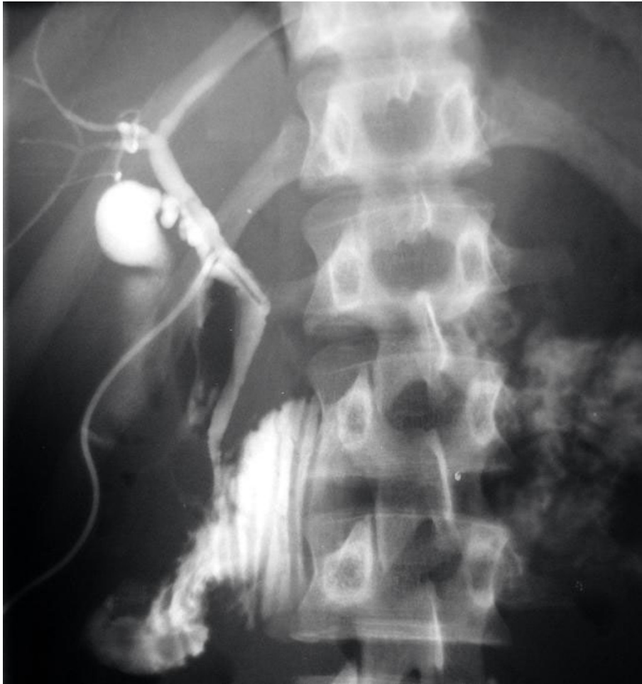
Figure 5 An intraoperative cholangiography after the reconstruction showing the contrast agent passing freely into the patient's duodenum.

case report, these aspects were decisive for the characterisation of the patient's injury and surgical technique selection.