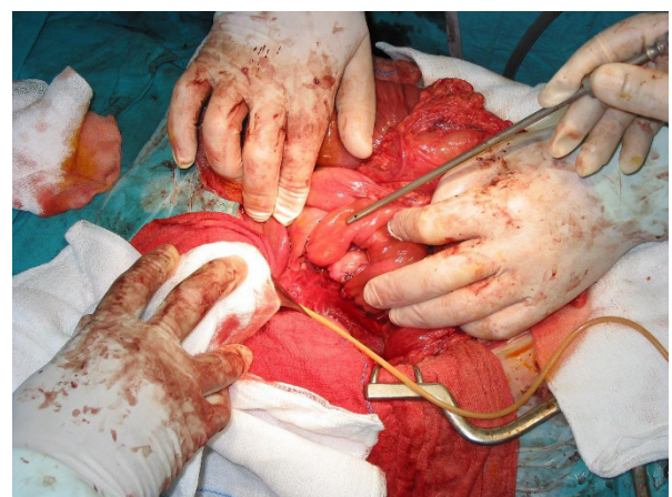
Figure 2 Two end-to-end anastomoses between the patient's duodenum and pedicled loop of ileum.