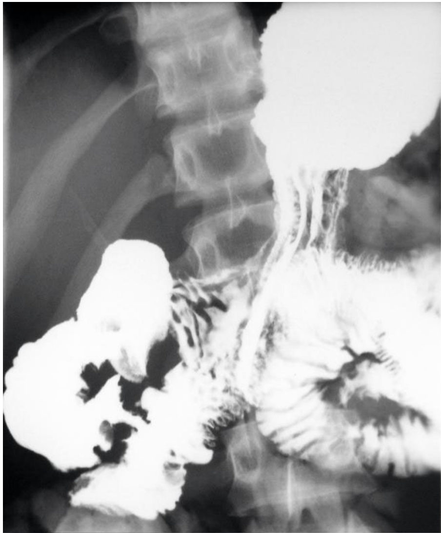
Figure 4 An upper gastrointestinal contrast study on the 20 th postoperative day, without pathological findings.

duodenal perforations from duodenal haematomas [9,10]. In our case report, the deterioration of the patient's clinical status including haematemesis and the inherent high suspicion of abdominal injury indicated the investigation of the intraperitoneal and retroperitoneal space with a CT scan. Although the CT scan did not show any duodenal disruptions, its findings combined with the clinical findings and the history of the accident increased our suspicion of a possible retroperitoneal duodenal injury.