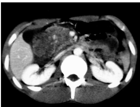
Figure 1 A computed tomography scan of the patient's abdomen showing a retroperitoneal haematoma at the duodenal level.

In order to restore the continuity of the patient's duodenum, we decided to interpose a pedicled loop of ileum (middle part of ileum) to bridge the gap. The two end-to-end anastomoses were performed at two layers (the bottom one in continuous suture) following catheterisation of Vater's papilla through a choledochotomy so that the papilla could be located and immobilised, in order to avoid including it in the suture line (Figures 2 and 3). Finally, a T-tube was placed through the choledochotomy and an intraoperative cholangiography confirmed that the patient's bile duct was unobstructed and the contrast agent was passing freely into the duodenum. There was no loss of blood during the operation. For better recovery, the patient was transferred to the intensive care unit, where he stayed for five days without presenting any particular problems.