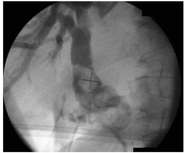
Figure 2 Intra-operative cholangiogram confirming common bile duct (CBD) stones and agenesis of the gallbladder.