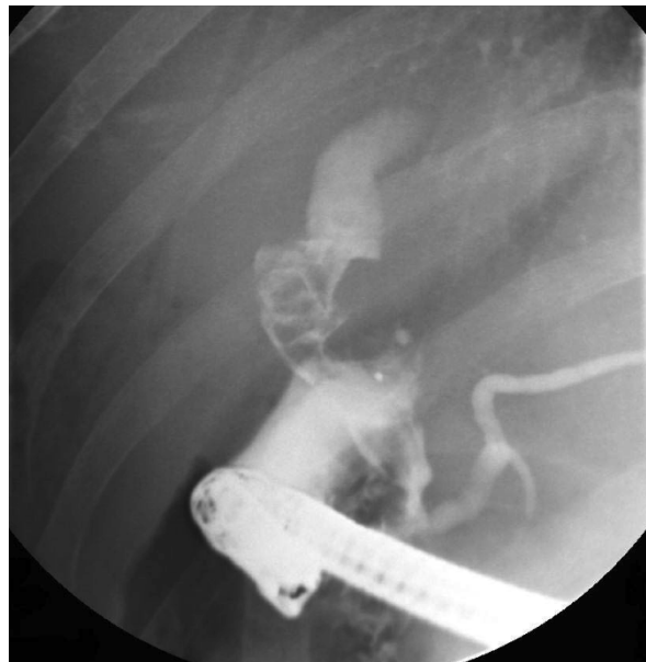
Figure 1 Pre-operative endoscopic retrograde cholangiopancreatography (ERCP) showing a dilated common bile duct (CBD) with stones and absence of the gallbladder.

Post-operatively, he made an uneventful recovery, and remains symptom free.