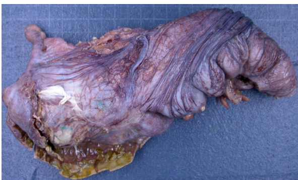
Figure 2 Gross specimen of ascending colon with perforation.

The exact etiology of Ogilvie's syndrome is unknown, but it has been associated with several disease processes such as trauma, abdominal and/or pelvic surgery, and sepsis [1]. Bed rest and abnormal electrolytes are also listed as factors associated with the development of the syndrome [4], and Strecker et al. reported that the association between Ogilvie's syndrome and vaginal delivery may be due to the declining serum oestrogen levels in the postpartum period [5]. In the only other reported case of