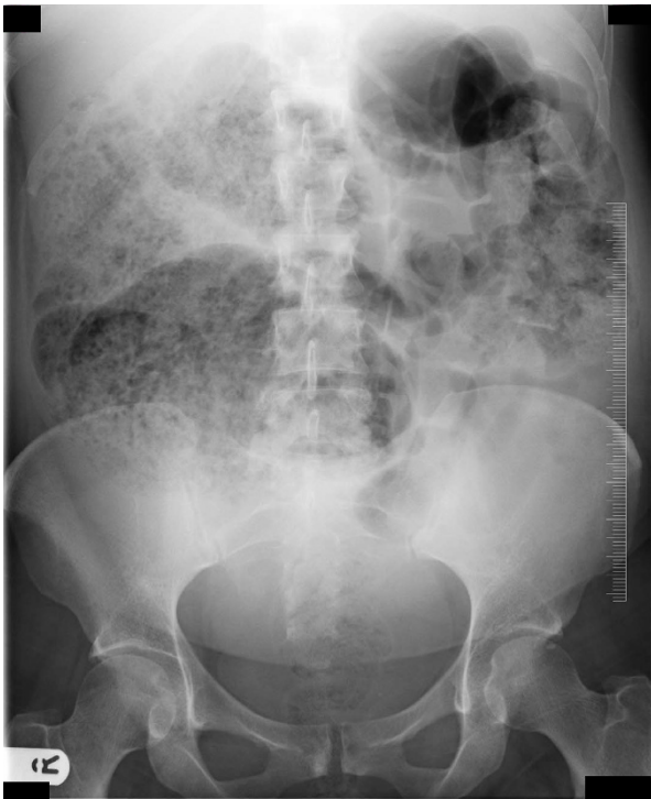
Figure 1 Abdominal radiograph.

logical examination of the right colon revealed ischemic changes.