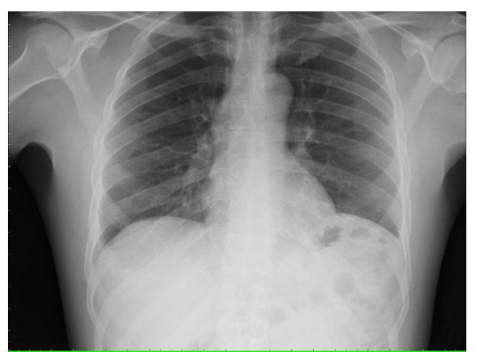
Figure I Chest x-ray showing no evidence of active pulmonary disease.

breaths per minute. Oxygen saturation was 95% on room air, which decreased to 90% during ambulation. There were no oral lesions. His neck was supple. Examination of the lungs revealed bilateral expiratory wheezes and rare rhonchi. Cardiac examination demonstrated normal first sound, second sound with a regular rhythm and no murmurs. His abdomen was soft, nontender, nondistended with normoactive bowel sounds. His extremities were warm and his skin was dry with multiple small herpetic ulcers on the left ear and the left side of the face.