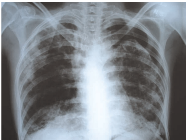
Figure 1. Chest X-ray film taken on the first admission to our institution showing large left pneumothorax estimated at 35% and reticulonodular infiltrates involving both lung fields.

positive end-expiratory pressure (PEEP) was maintained at 5mmHg. Over a 3-week period, although the chest tubes were in place and no bronchopleural air leakage was noted, there was no significant improvement in either of the bilateral pneumothoraces. The PaO 2 /FiO 2 ratio was constantly rising, reaching around 360 a month into the ICU admission, when the patient passed away due to intractable hypoxic respiratory failure. The poor lung