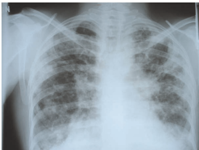
Figure 2. Chest X-ray film taken 1 year before the patient's first admission to our institution, showing patchy areas of increased density in the periphery of both lung fields, hyperinflation of the lungs and areas of honeycombing in the right lower lobe consistent with interstitial fibrosis.

positive end-expiratory pressure (PEEP) was maintained at 5mmHg. Over a 3-week period, although the chest tubes were in place and no bronchopleural air leakage was noted, there was no significant improvement in either of the bilateral pneumothoraces. The PaO 2 /FiO 2 ratio was constantly rising, reaching around 360 a month into the ICU admission, when the patient passed away due to intractable hypoxic respiratory failure. The poor lung