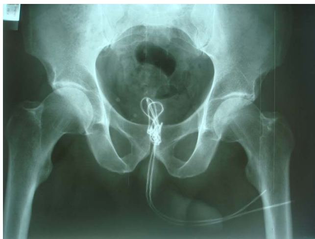
Figure 2 X-ray of kidney, ureter, bladder: coiled up radio-opaque wire inside the bladder.

The most common reason for self-insertion of a foreign body into the male urethra is of erotic or sexual nature, especially masturbation or sexual gratification [1-4]. A mental illness or drug intoxication may also be the reason