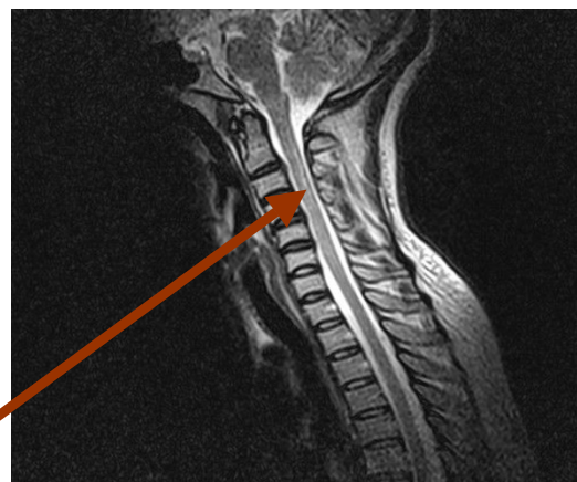
Figure 2 Cervical spine magnetic resonance imaging post-treatment with resolution of the previously noticed focus (Arrow B).

Devic's NMO is characterized by a unilateral or bilateral optic neuritis and transverse myelitis, with a variable