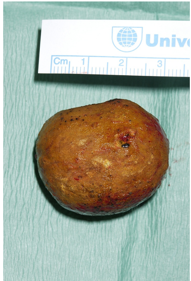
Figure 3 Gallstone. The gallstone measured 3 cm in size.