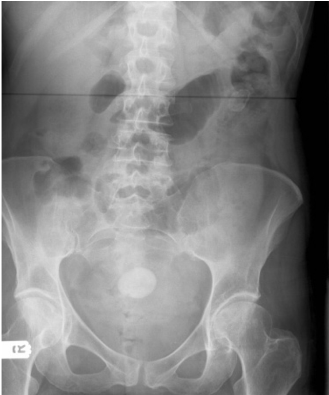
Figure 1 Abdominal X-ray. The X-ray shows air in the biliary tree, distended loops of small bowel, and calcified gallstone in the left side of the abdomen.