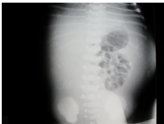
Figure 1 Abdominal radiograph taken 1 hour after birth, shows mottled calcification in the right upper quadrant, curvilinear calcification in the left flank and several loops of non-dilated bowel, but no free gas.

A second radiograph was performed approximately 4 hours after birth because of increasing abdominal distension in the neonate. On this second radiograph, free gas was visible in the peritoneal cavity (Figure 2). The surgical team was subsequently contacted.