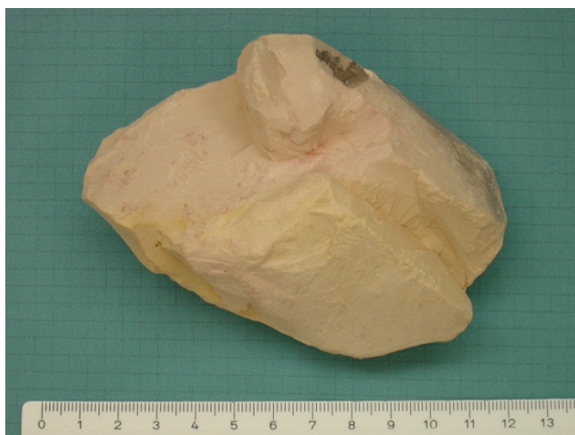
Figure 1 The stone consumed by the patient. Scale in centimetres.

During a follow-up visit and further explicit questioning about particular eating habits, the patient reluctantly disclosed an almost daily consumption of 'a friable stone' over more than a decade. She reported having developed a particularly strong craving for such stones, of which she would suck on small pieces until these completely dissolved. She had acquired this habit 15 years ago in her home country Cameroon, where consumption of stones is common. To characterise the chalky stone (Figure 1), we contacted our geosciences department. X-ray diffraction measurements confirmed that the substance was essentially composed of kaolinite with traces of quartz (Figure 2). After cessation of kaolinite ingestion, we administered intravenous iron replacement therapy (total of 1000 mg) and the anaemia was corrected within 1 month (Hb 125 g/litre, MCV 79.4 fl, MCHC 333 g/litre,