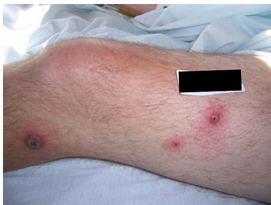
Figure 1 Pustular lesions with central necrosis on the patient's leg.

revealed pancolitis, duodenitis and gastritis with no evidence of granuloma. The patient was diagnosed with an exacerbation of Crohn's disease and started on intravenous methylprednisolone 60 mg q 12 hrs, with continuation of azathioprine and Asacol. He was also given a dose of intravenous Infliximab. The rash showed no improvement after three days of antibiotics. A punch biopsy of one of the skin lesions revealed dense dermal infiltrate composed predominantly of neutrophils, with no evidence of vasculitis. This was consistent with the diagnosis of Sweet's syndrome. (Figure 2). Antibiotic treatment was stopped. The patient's symptoms and rash rapidly improved with systemic corticosteroid treatment.