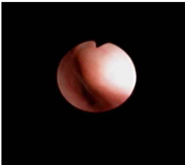
Figure 2 Flexible bronchoscopy demonstrated a compression of the right lower and middle lobe bronchi with a slit-like appearance.

found restrictive and/or obstructive airway abnormalities in patients with scoliosis of less than 60°, even though many of these patients were asymptomatic [2]. Adolescent idiopathic scoliosis consists of a lateral and rotational spinal curvature in the absence of associated congenital or neurologic abnormalities. Longitudinal studies [3,4] have estimated the prevalence of idiopathic scoliosis as 2% of the adolescent population, using a definition of a spinal curve as greater than 10°. However, clinically significant curves in the range of 40° to 100° are rare [5]. The incidence of brainstem or spinal cord anomalies, such as tethered cord, in patients with idiopathic scoliosis ranges from 4% to 58% (see [6]).