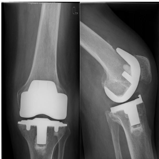
Figure 1 Radiographs of the prosthesis three years after total knee arthroplasty show normal alignment without evidence of loosening.

side associated with substantial synovitis and polyethylene debris scattered all around the joint. Slight delamination of the posterolateral part of the insert was visible. An arthrotomy showed no loosening of the femoral and tibial components of the TKA. There was no malrotation of both components. The tibial slope was not excessive (almost neutral). The trapped posteromedial meniscus remnant was removed (Figure 3) and a total synovectomy with an isolated exchange of the polyethylene insert was performed. Intraoperative cultures from both the fluid aspiration and the remnant meniscus yielded no microorganisms. Postoperatively there were no complications with a complete resolution of all complaints and symptoms. At 3 years follow-up he remains complete symptom free with an unrestricted range of motion.