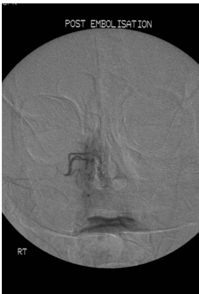
Figure 3 Post particle embolisation of the right sphenopalatine Artery demonstrating absence of pooling of contrast in the left nasal passage.