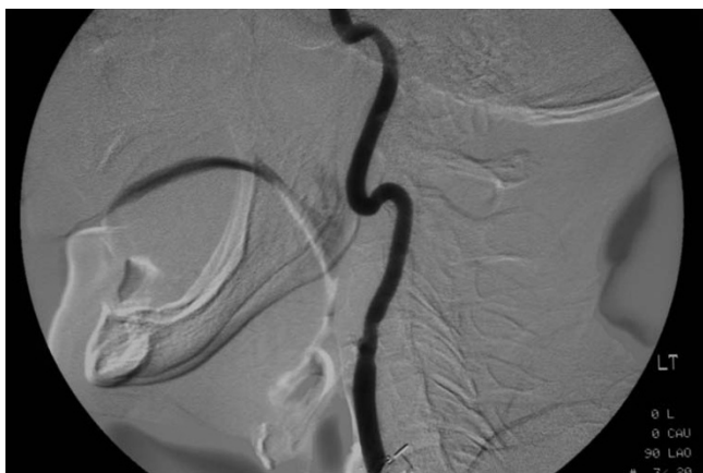
Figure 1 Left common carotid artery angiogram demonstrating external carotid ligation.

A microcatheter was advanced distally in the right SPA and angiography showed pooling of a small amount of contrast in the upper part of the left nostril. Embospheres in the 80–120 \mu size range and PVA particles in the 355–500 \mu range were injected into the right SPA. Subsequent angiography revealed a reduction in the number of the nasal branches and no further pooling (Figure 3). The nose was packed anteriorly at the end of the procedure. Packing was removed 24 hours later and the patient has had no further bleeding, and was hemorrhage free at follow up.