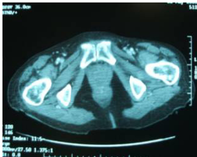
Figure 2 CT post chemotherapy showing relatively normal pelvic architecture.