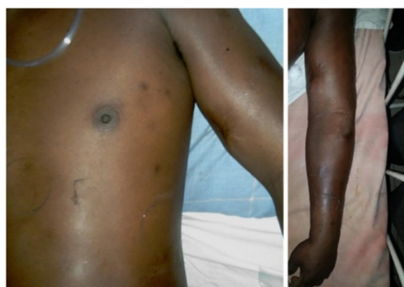
Figure 4 Clinical deterioration and progression of necrotizing fasciitis. Image depicts necrotizing fasciitis ascending to involve the chest and left upper limb.

The first patient had NF and muscle necrosis of the adductor compartment of his thigh from the outset, but failure of the primary care center to realize the masked signs of NF led to the infection moving up to involve his upper trunk and arm. The delay in definitive management resulted in spread of infection with eventual sepsis and death. Case 2 was an immunocompromised patient who presented late. The inability of her body to mount