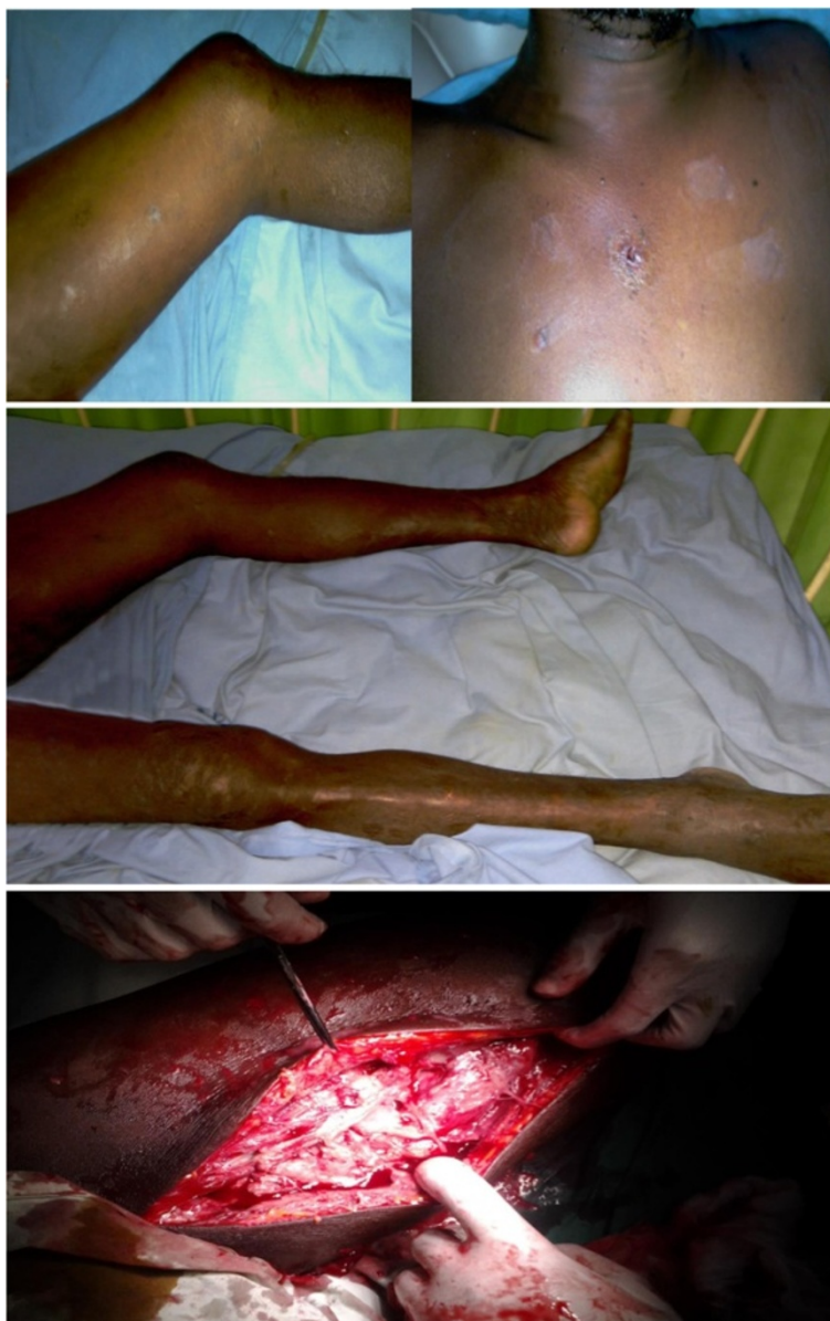
Figure 1 Initial clinical presentation and surgical intervention. The two top images depict the various healed and recent injuries sustained by the patient. The image in the middle shows a laterally rotated swollen left thigh and lower limb. The bottom image depicts necrotic muscle on surgical debridement of the left thigh.

Whole blood analysis revealed an elevated leucocyte count of 25.87 \times 10^9/\mu\text{L} (normal: 4 to 10) which was predominantly neutrophilic (83%; normal: 50 to 70) with preserved hemoglobin and platelets. Inflammatory markers were elevated with an erythrocyte sedimentation rate (ESR) of 51mm for the first hour (normal: < 15). His renal functions were within reference range and remained normal throughout. An X-ray of his abdomen revealed dilated gaseous bowel loops (Figure 2) while an X-ray of his left thigh failed to demonstrate any abnormality or gas (Figure 2). An urgent magnetic resonance imaging (MRI)