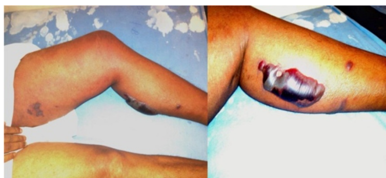
Figure 5 Superficial skin manifestations of necrotizing fasciitis. Image on the left shows early skin involvement of the left medial aspect of the thigh and bullae formation of the calf, which is more clearly demonstrated on the image on the right.

an effective immune response resulted in rapid progression of NF with sepsis and septic shock despite urgent surgical and medical intervention.