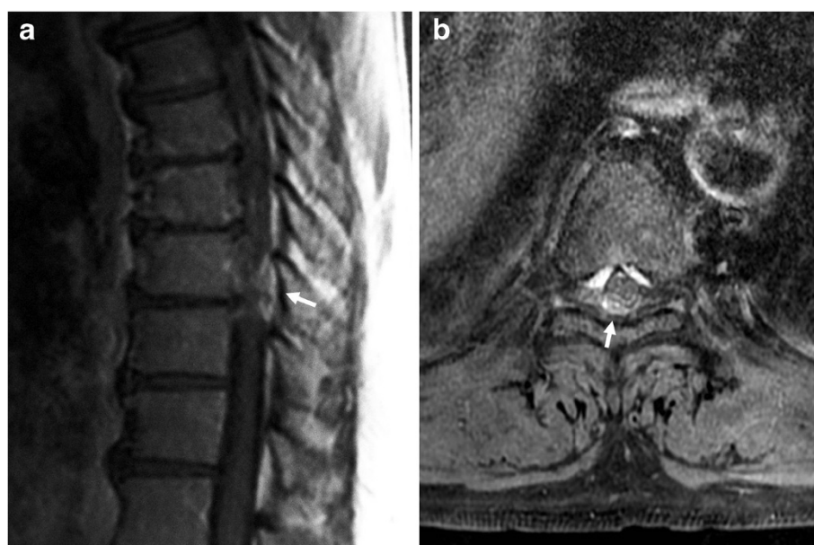
Figure 1 Pre-operative magnetic resonance imaging of the thoracic spine. Sagittal gadolinium-enhanced T1-weighted imaging (a) and axial gadolinium-enhanced T1-weighted imaging with fat suppression (b) show a peripherally and heterogeneously enhancing posterior epidural mass at the T9-T10 level, compressing the spinal cord (arrows).