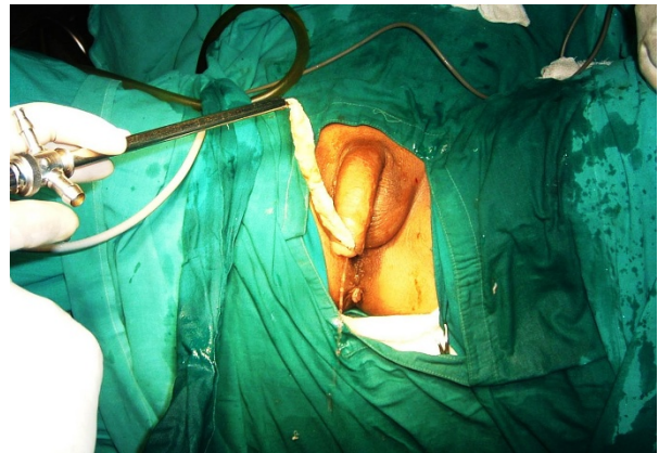
Figure 3 Transurethral removal of the surgical sponge using a lithotrite.