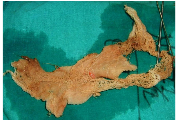
Figure 4 The surgical sponge after removal.