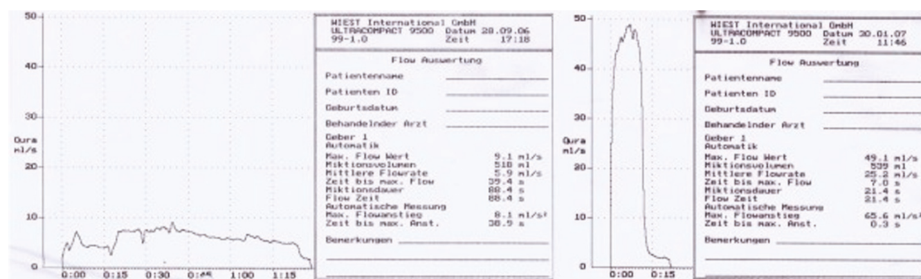
Figure 1. (A) and (B) Uroflowmetry before and after reconstruction (case 1).

The choice of the appropriate material for reconstruction of the male urethra remains a focus of controversy