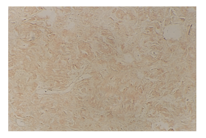
Figure 3. The aggregates of amyloid stain with Congo red.

a mean 7.6-year follow up of two patients no recurrence was observed, while in another study by Piazza et al. [15], 17 out of 32 patients were asymptomatic in a 20-year follow up. In secondary amyloidosis, a reduction in amyloid deposition may occur following successful treatment of the underlying disease.