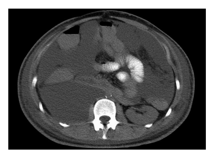
Figure 1. A CT scan of the abdomen with an oral contrast agent, demonstrating marked intra-abdominal lymph leakage postoperatively with organ compression and abdominal compartment syndrome.

paralytic ileus, pleural effusions and respiratory failure, and was transferred to the intensive care unit for elective intubation, ventilatory support and chest tube drainage of the pleural effusions (Figure 2).