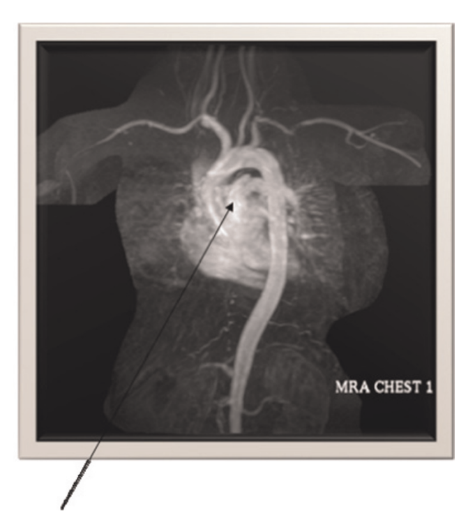
Figure 2. Cardiac magnetic resonance imaging demonstrating an intimal dissection flap of the main pulmonary artery.

tear. Whether medial degeneration causes the dissection, predisposes to intimal tears, or results from chronically raised intravascular pressure remains controversial. The main pulmonary trunk is the site of dissection in about 80% of patients, usually without involvement of the branches. Occasionally, an isolated dissection of the right or left PAs and intrapulmonary branches can occur [1-3,13]. In a small proportion of patients, PA dissection may occur at the site of localized aneurysm formation.