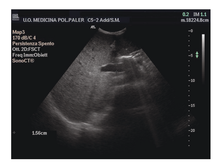
Figure 1. Dilated portal vein and an increased anteroposterior diameter of the liver.

On admission, hematologic investigations confirmed the decreased values of hemoglobin (8.8 g/dl), platelets (66.000/mmc) and WBC (1.270/mmc). Alanine amino transferase (ALT) and aspartate amino transferase (AST) were 11 and 15 IU/L; alkaline phosphatase (AP) was 266 IU/L; gamma-glutamyl transferase ( \gamma GT) 85 IU/L and total bilirubin (TB) 0.59 mg/dl. Serum total protein was 7.4 g/dl, (albumin 3.24 g/dl, \gamma -globulin 2.03 g/dl), total cholesterol 65 mg/dl, INR 1.17, aPTT 32.6 seconds,