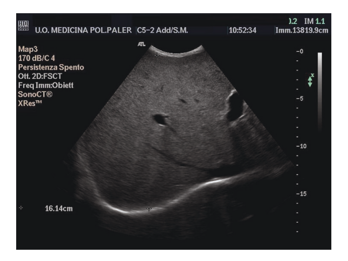
Figure 2. Thin right hepatic vein and an increased antero-posterior diameter of the liver.

Because of the very marked weight loss, severe leukopenia and massive splenomegaly, which are relatively unusual in the clinical course of liver cirrhosis, and suspecting a possible lymphomatous progression of the HCV disease, we consulted a hematologist, who confirmed our suspicions and performed a bone marrow biopsy. The histologic picture showed a diffuse or nodular aggregation of histiocytic hyperplasia, containing within the cytoplasm many elements referable to the genus Leishmania