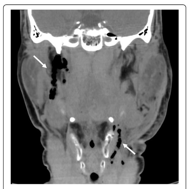
Fig. 1 Computed tomography scan showing air in the regions of the left mandible and right styloid process of the temporal bone ( white arrows ), suggesting a penetrating neck injury extending to the skull base

revealed anemia (hemoglobin, 9.5 g/dl; hematocrit, 28.5%) and prolonged prothrombin time (percentage of standard value, 60.2%).