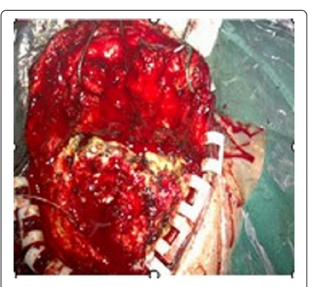
Figure 3 Tumor resection. The tumor was completely resected and measured 7cm×6cm×4cm.

A pathological microscopic examination of the resected tumor (Figure 4) showed a malignant histiocytoma (undifferentiated sarcoma). It was gray-white, had no capsule, was gray on the cut section, had areas of hemorrhage and necrosis, and had a ductile texture.