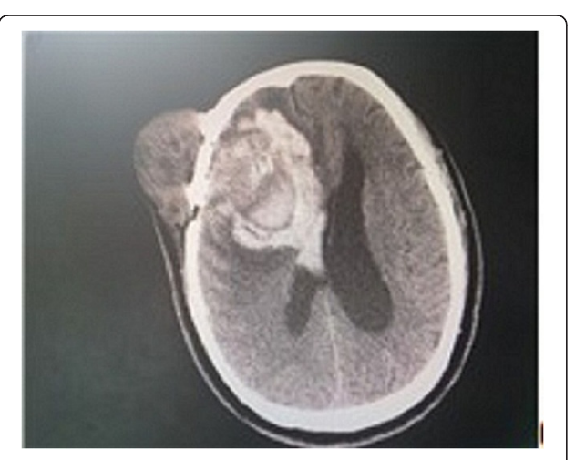
Figure 1 Preoperative computed tomography. Shows intracranial hemorrhage with a volume of approximately 90mL, and a midline shift of over 1.5cm.

Our patient then underwent surgery to resect the subcutaneous tumor and evacuate the intracranial hematoma under general anesthesia. An incision was made along the one from the original surgery. During the operation, it became apparent that the main part of the tumor was located in the subcutaneous tissue of his right frontal region. The tumor was approximately 7cm×6cm×4cm (Figure 2), fully enveloped, and characterized by abundant revascularization. The cyst of the tumor was intact, and his temporal muscle tissue was thin. His cranial periosteum and cerebral dura mater were invaded by the tumor, resulting in a thin, brittle skull (Figure 3). His dura mater was also thin and light yellow in color. The tumorous hemorrhage extended into his intracranial tissue, but no tumor tissue was seen in his subdural area. The intracranial hematoma was successfully removed during the operation (70mL from the right frontal part, 20mL from the intraventricular hematoma). The subcutaneous tumor was totally resected along with some affected cranial tissues. The epidural bleeding was completely stopped. However, the temporal muscle fascia was incomplete because of the