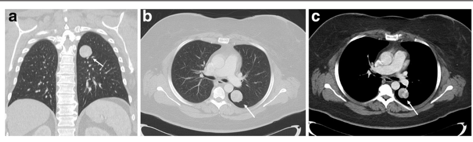
Figure 1 Computed tomography of the chest. (a) Coronal and (b, c) axial plane. The glomangioma is marked with an arrow.

being present in less than 1% of the cells, while smooth muscle antigen was positive in the cytoplasm of almost all of the tumor cells. Type IV collagen exhibited a chicken-wire pattern between the cells, which were negative for S-100, CD31, estrogen receptor and pancy-tokeratin AE1/AE3 staining in the glomus cells.