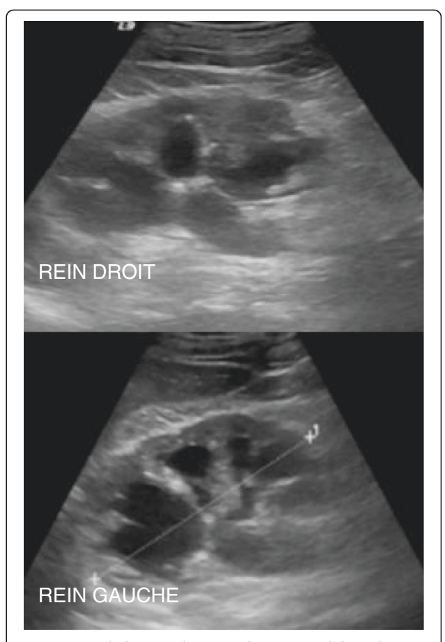
Figure 2 Renal ultrasound images showing two bilateral ureterohydronephroses. REIN DROIT: right kidney; REIN GAUCHE: left kidney.

was removed after 2 days, after which the patient was able to void without difficulty. The patient was discharged 3 days after surgery without any obvious complications. A pathologic examination revealed benign prostatic gland hyperplasia. At the patient's 3-month follow-up examination, his JJ stent was removed. He had comfortable urination without renal failure.