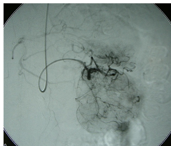
Figure 2 Angiographic findings of the tumor. Angiography via the left gastric artery showed staining of the tumor.