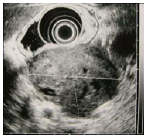
Figure 3 Endoscopic ultrasonographic findings of the tumor. Endoscopic ultrasonography demonstrated a heterogeneous lesion 60mm in diameter, arising in the posterior wall of the stomach.

Nephrotic syndrome can occur as malignancy-associated PNS, and previous studies have estimated that cancer occurs in 11% to 22% of patients with nephrotic syndrome [2,6,7]. Therefore, if an adult presents with nephrotic syndrome, physicians should bear in mind the risk of underlying malignant disease. Gastric cancer, lung cancer, and malignant lymphoma are frequently associated with nephrotic syndrome of which the rates are 25, 15 and 10%, respectively [8]. To the best of our knowledge, GIST has not been previously reported as an