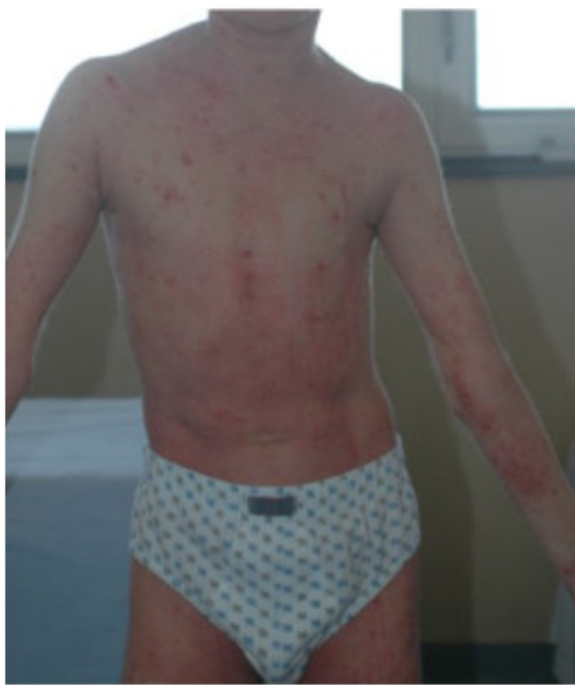
Figure 1 Atopic dermatitis.

the basal value of somatomedin C was extremely low (109ng/ml; normal range, 247ng/ml to 482ng/ml), we performed an arginine test to evaluate the hGH release from the pituitary gland after stimulation with arginine (Table 1). The laboratory test showed a hGH level less than 10ng/ml after 60 minutes. His sex hormones, prolactin and cortisol levels were all normal.