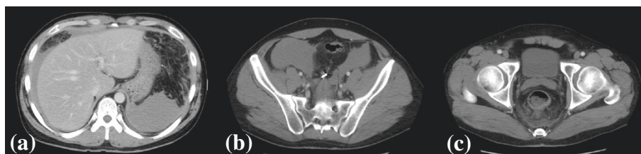
Figure 3 Follow-up contrast-enhanced abdominal computed tomography taken on hospitalization day eight. (a) Decrease in the volume of hemorrhagic ascites (b) An absence of extravasation (c) Increased contrast medium uptake by the rectal walls.

This case of spontaneous rupture of a dissecting aneurysm in the peripheral blood supply strongly suggests