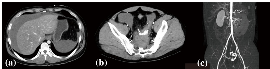
Figure 1 Contrast-enhanced abdominal computed tomography on admission. (a, b) Accumulation of hemorrhagic ascites and extravasation of radiopaque dye into the pelvic cavity. (c) A three-dimensional reconstruction of the computed tomographic image.

The pathophysiology of vascular changes in patients with NF-1 is poorly understood, but fibromuscular dysplasia with prominent thickening of the tunica intima has been reported as a result of smooth muscle cell proliferation [10-12]. This leads to thinning of the media, weakening of the elastic lamina and narrowing of the lumen. The NF-1 gene is large and spans over 350 kilobases; the protein product, neurofibromin, acts as a negative regulator in the Ras pathway. Neurofibromin expression has been identified in the endothelial and smooth muscle cells of blood vessels. Patients with NF-1 are usually expected to exhibit haploinsufficiency of neurofibromin activity, which may lead to cellular proliferation [8]. These findings imply a pathogenic relationship between vascular lesions and the neurofibromas that characterize NF-1.