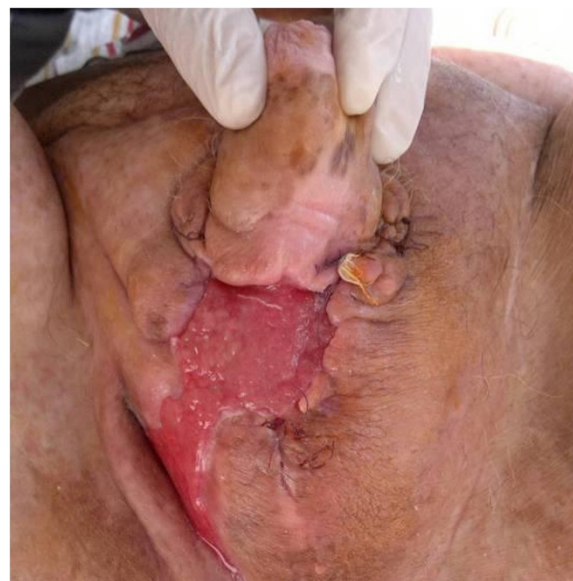
Figure 2 Exposure of the wound at the time of discharge.

Emergency surgical removal of all affected tissue is the primary mandatory treatment even though several repeated debridements might be necessary [5]. However, surgery represents only the first step of a multidisciplinary approach, which involves a urologist, general and plastic surgeon, microbiologist, and nutritionist [7]. Adjuvant treatments include the use of HBO, which has been reported to reduce Fournier's gangrene mortality compared to exclusive surgical debridement. Optimal tissue oxygenation, obtained by HBO therapy, potentiates