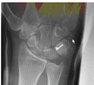
Figure 4 Posteroanterior radiograph of the right wrist at six weeks post-operation. The image shows no evidence of triquetral body non-union, and compression screws in situ .