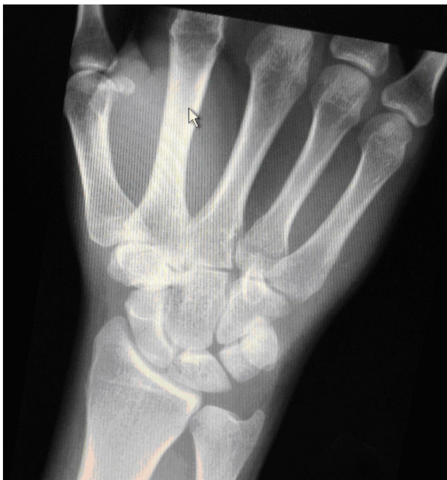
Figure 1 Posteroanterior plain radiograph of the right wrist at six weeks after the injury. The image shows no obvious evidence of bony injury.

compression screws (Stryker Ltd). No bone graft was used and the wrist was mobilized immediately after surgery. Our patient was followed-up at two weeks, six weeks, and 12 weeks post-operatively to union. The fracture went on to complete union radiographically (Figure 4). Our patient returned to work, with resumption of his pre-injury activity level.