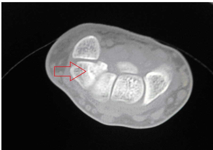
Figure 3 Axial computerized tomography (CT) at six months after the injury. The image shows a non-united, displaced, and isolated fracture of the body of the triquetrum.